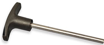
The BFM® 'TR Release Tool'.

The BFM® TR (tool release) O40E and O40AS fittings have an embossed identifier stamp to make them easy to differentiate from our standard fittings.